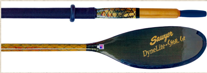
Sawyer Artisan Series DyneLite Square Top Oars