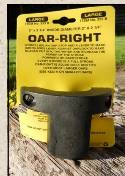
Stubby Oar Right $26ea.