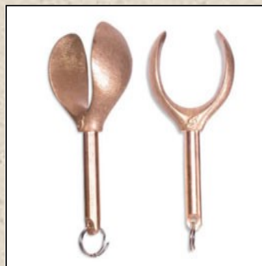
Sawyer Cobra Oarlock pin $64ea.