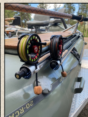
AlpenCraft Extendable length rod holster. Aluminum, powder coated $395 ea.