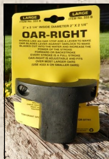
Stubby Oar Right $26ea.