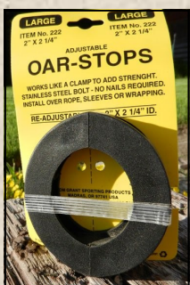
Composite Split Collar Oar Stop $19 ea.