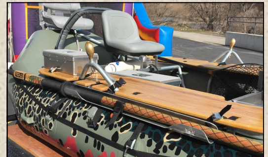
SDG Spare oar Quick Draw Holster $110