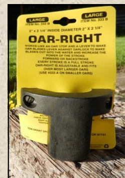
Stubby Oar Right $27ea.